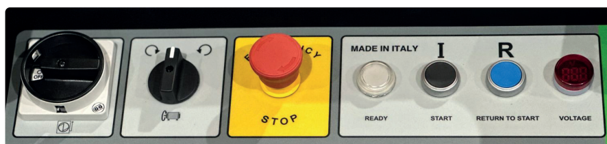
Low voltage of the control electrical panel (24v)